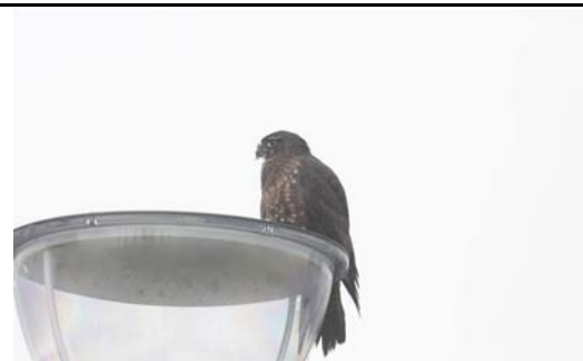
Our resident female falcon who arrived in Jan.

Ildica Boyd writes: "With much disappointment but realism we have postponed the Art Weekend for a year, so we're now aiming for 4th- 6th April 2021. There were 39 artists scheduled to exhibit, including 14 new ones, so we are hoping they will still be on board for next year. Equipment bookings and advertising was halted, and rebooked for next Easter. The many individuals who were also hosting workshops and talks, will either be postponed till next year, or will be rolled out within the village as weekend events during the remainder of this year. Thanks to all who had put their hands up, and we look forward to 2021".